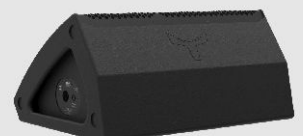
Perspective rear view